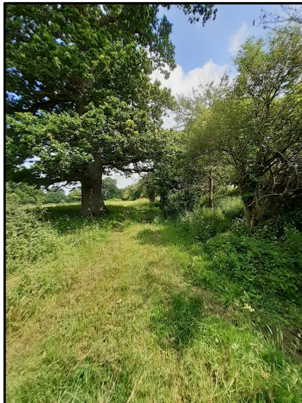
Photograph 20, nearer to CE2 looking towards CE1