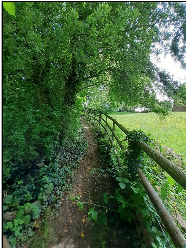
Photograph 8, south-east of point A2 and east of the route looking towards point A3