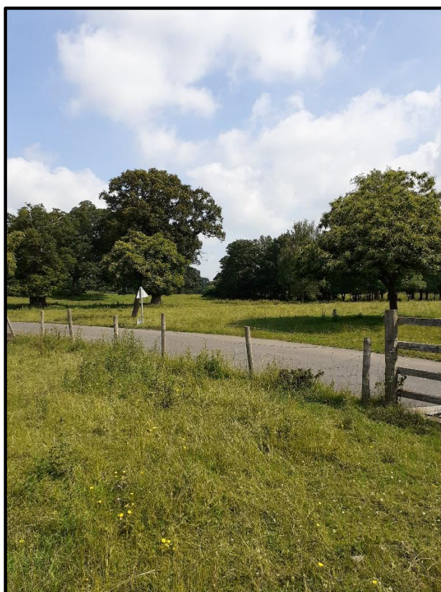
Photograph 22, to the south-west of Hazlegrove School drive looking towards CE2