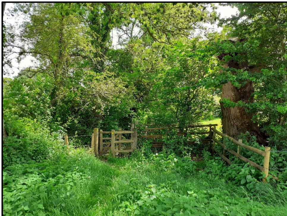
Photograph 6, near point A2 looking towards point A3