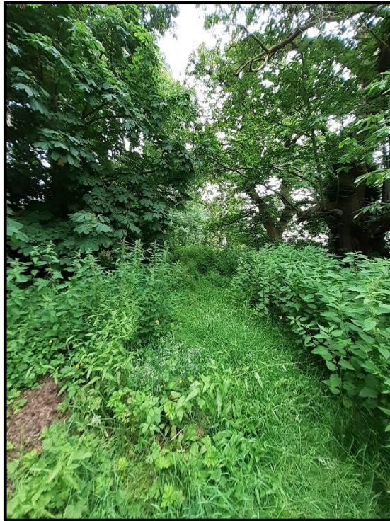
Photograph 11, at the junction of footpaths WN 23/40 and WN 23/38 looking towards point B