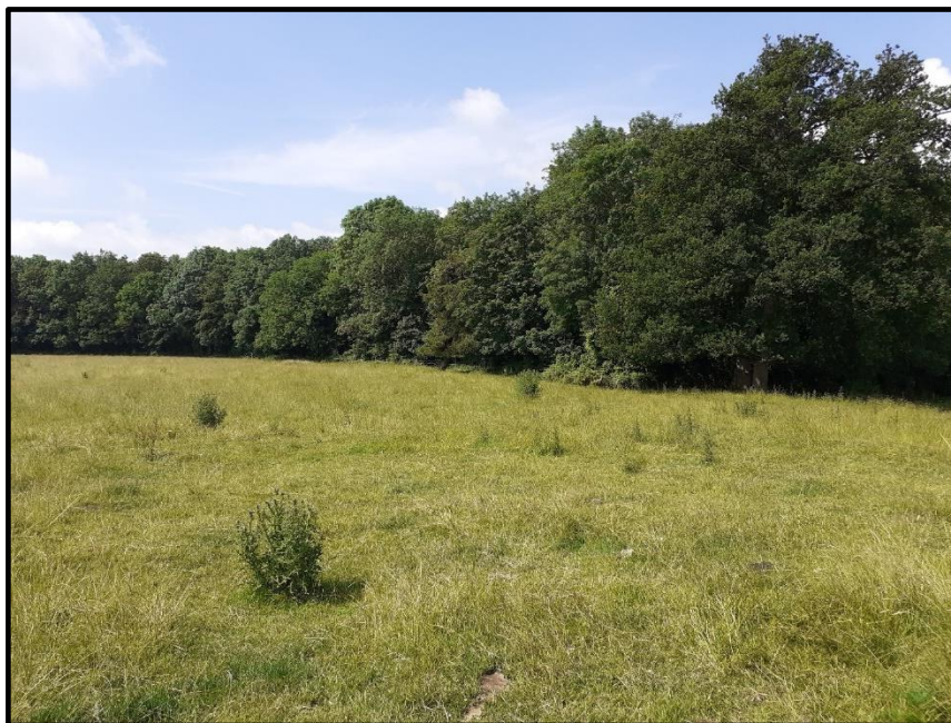
Photograph 23, between points CE2 and CE3 looking towards CE3