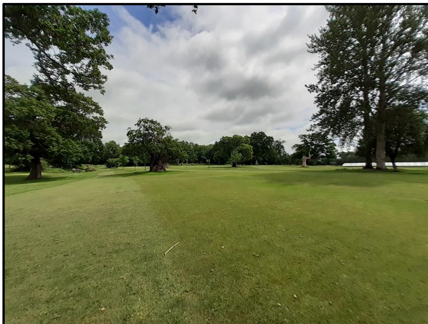
Photograph 9, near point A3 looking across school sports grounds towards point B