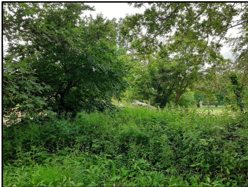
Photograph 14, close up at point C looking towards point CE1