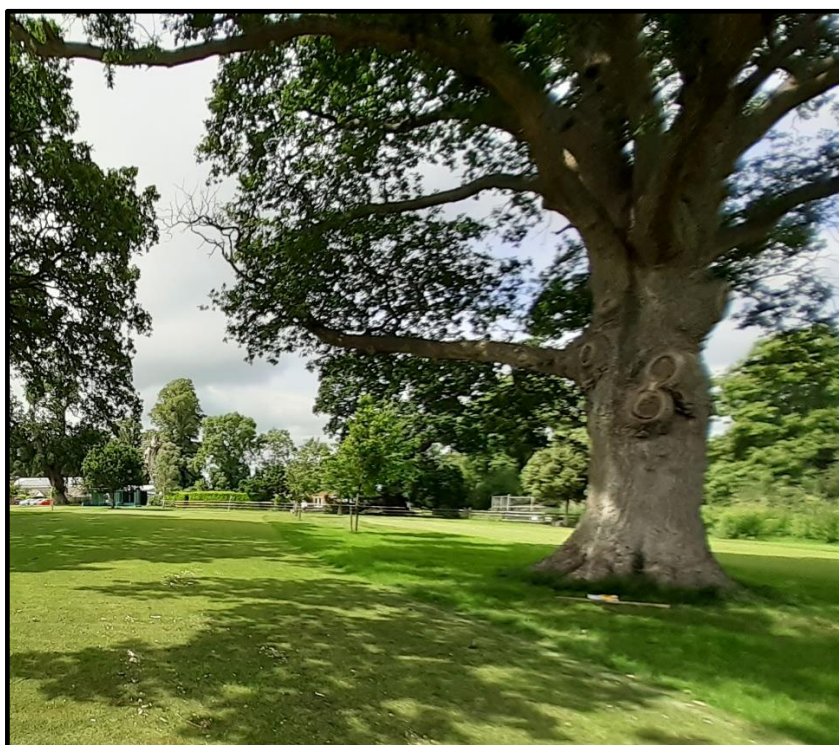
Photograph 10, between points A3 and B looking towards point A3