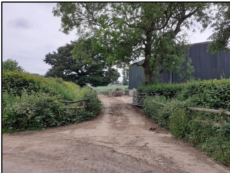
Photograph 2, at point A looking south