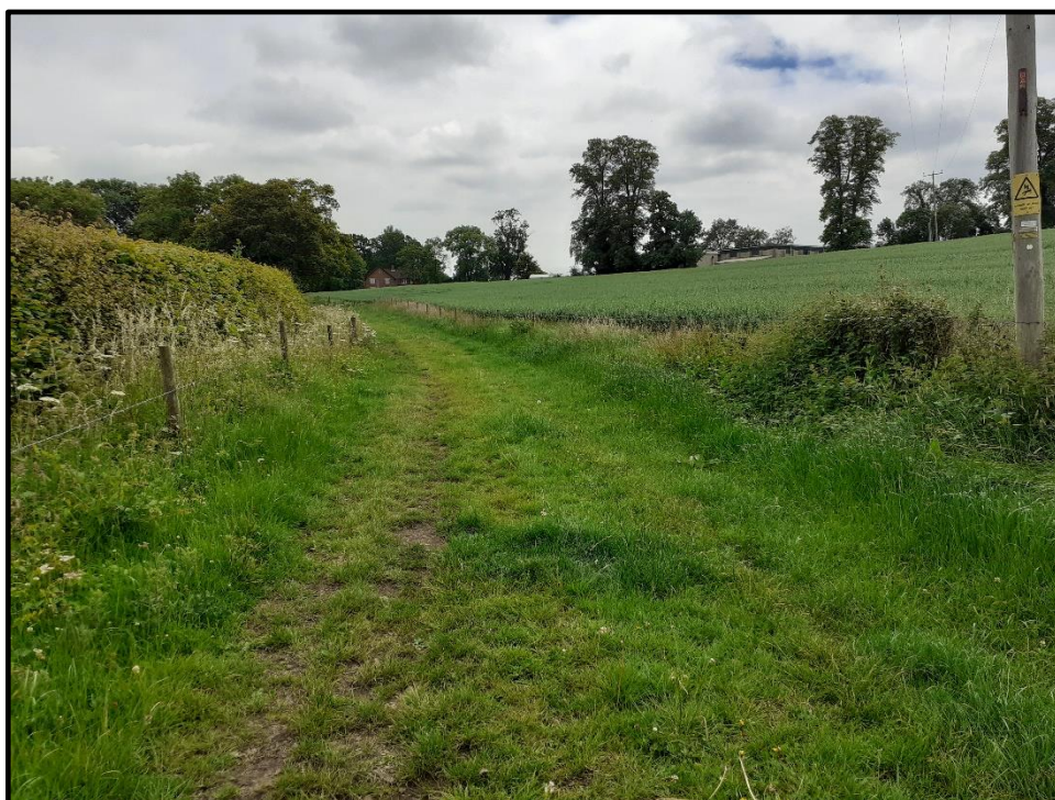
Photograph 4, between points A and A1 looking towards point A1