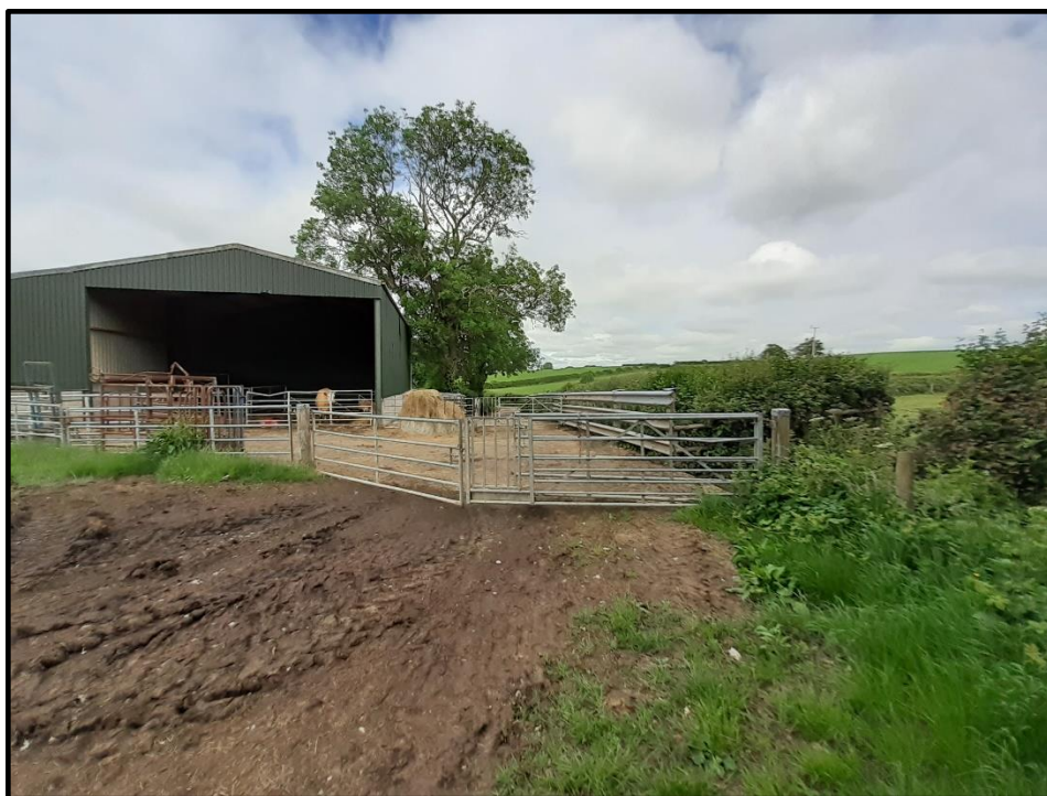
Photograph 3, just south of point A looking back towards point A