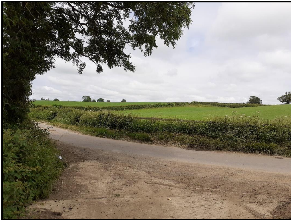
Photograph 1, at point A looking north onto Babcary Road