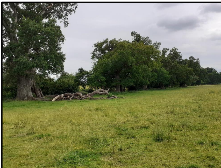
Photograph 17, to the west of CE1 looking towards the line of the route between CE1 and CE2