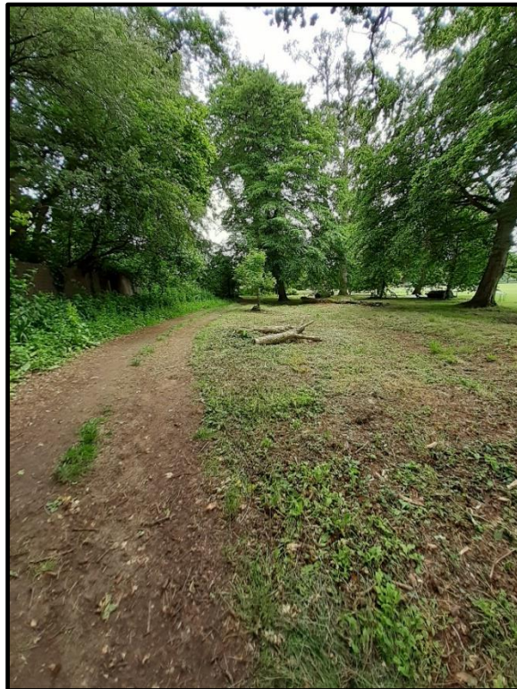
Photograph 12, between points B and C, looking towards C