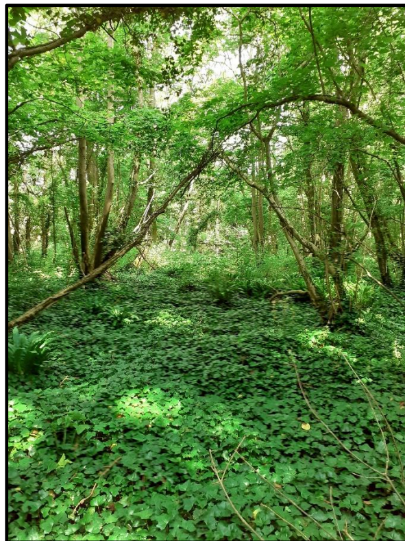
Photograph 26, between points CE4 and E looking towards CE4