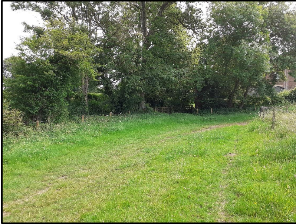
Photograph 5, just north of point A2 looking towards point A2