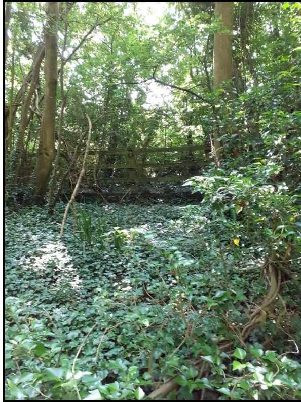
Photograph 27, between points CE4 and E looking towards E