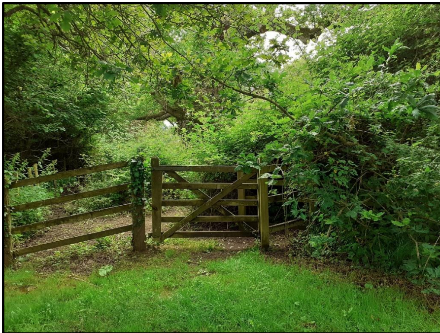
Photograph 16, at point CE1 looking towards point CE2