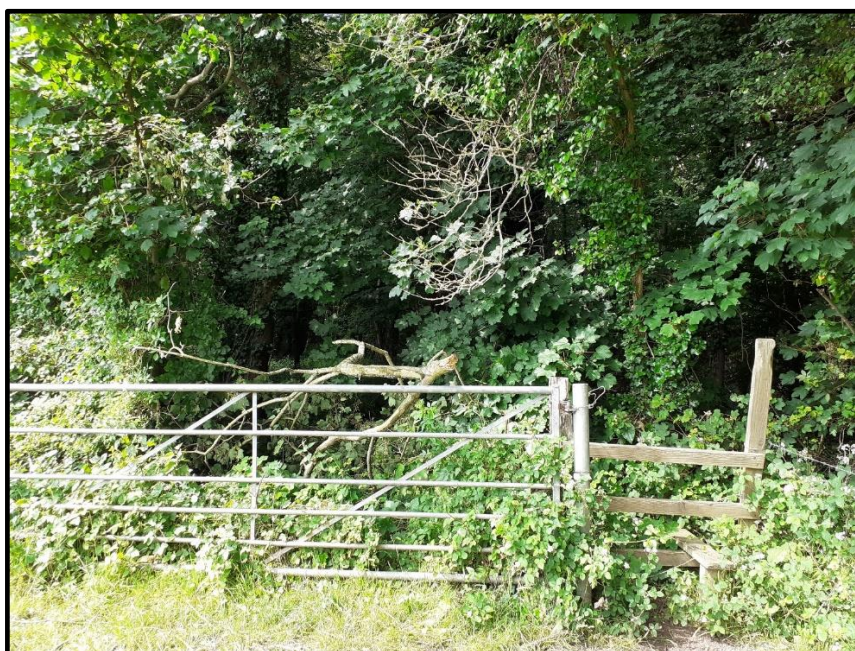
Photograph 24, at point CE3 looking towards point E