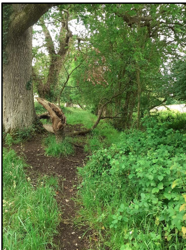
Photograph 18, between CE1 and CE2 looking towards CE1