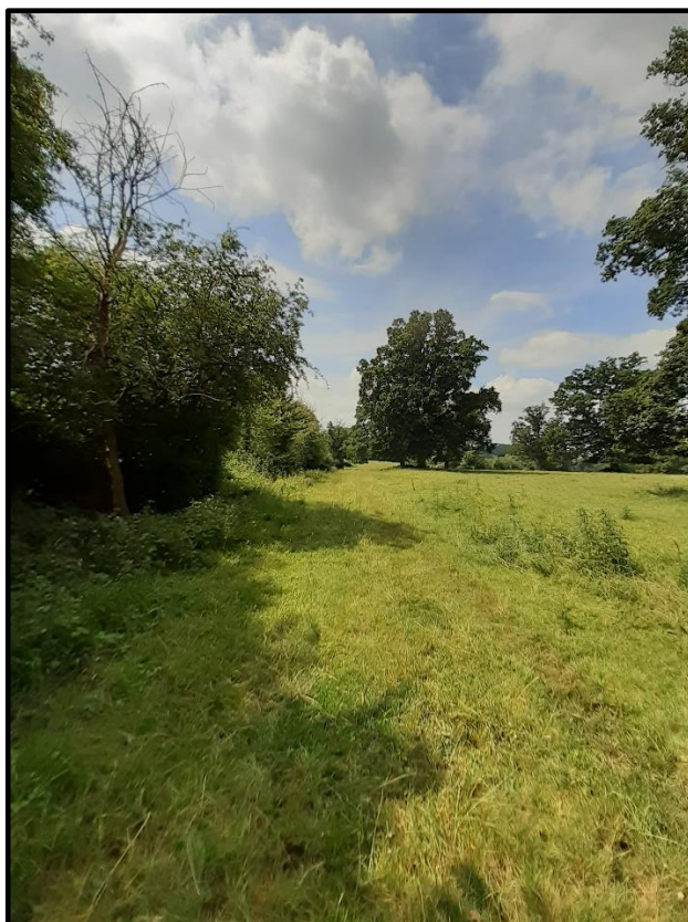
Photograph 21, nearer to CE2 looking towards CE2