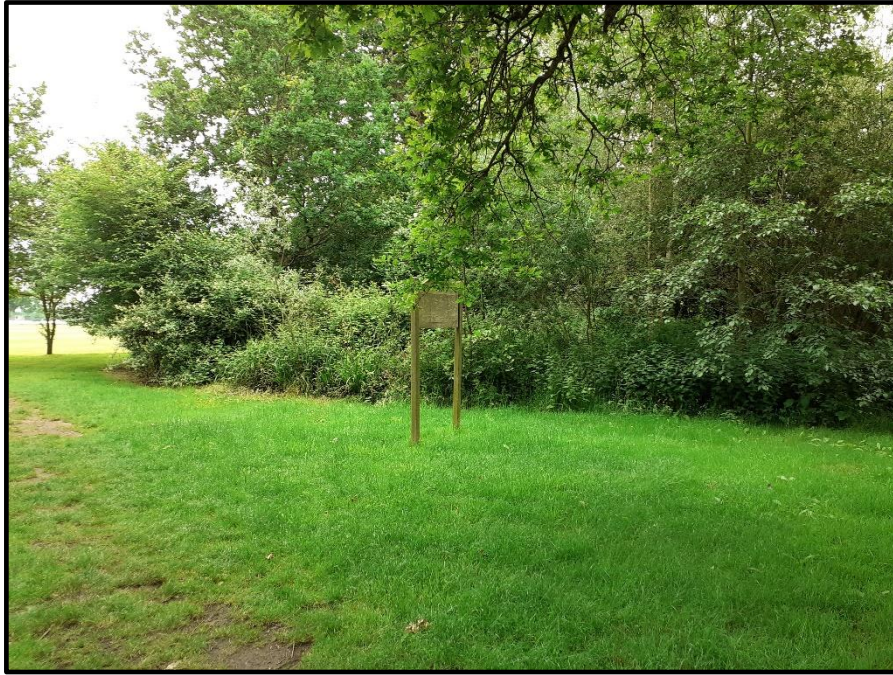
Photograph 15, at point CE1 looking towards point C