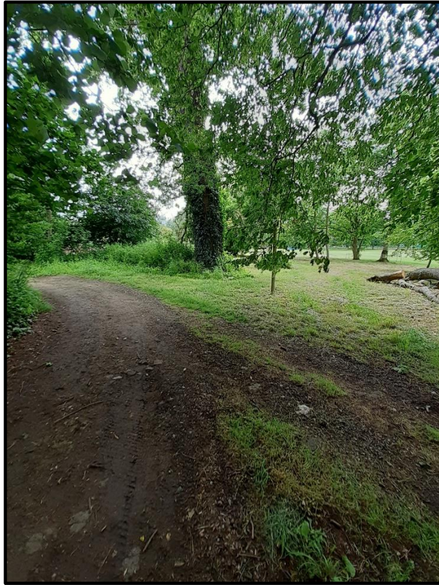
Photograph 13, at point C looking towards point CE1