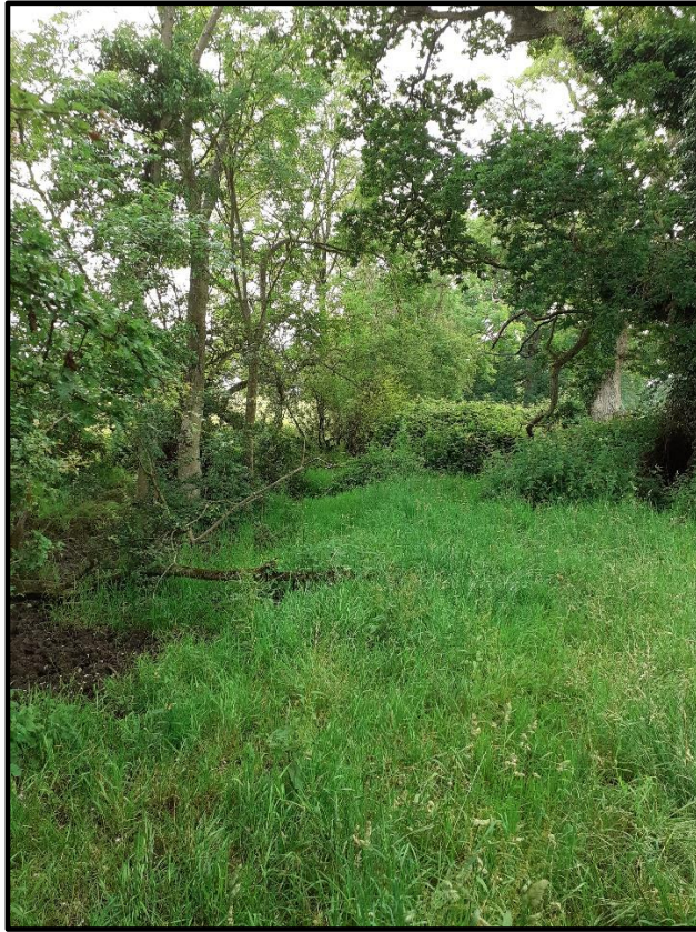
Photograph 19, between CE1 and CE2 looking towards CE2